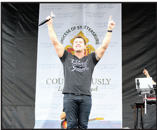
Jeremy Camp's scheduled performance was a massive draw for many attending the Family Faith Fest. Camp has 41 radio No. 1 hits and sold more than 4.5 million albums.

Camp and Colton Dixon, along with other musical performers. Fest-goers could also visit the 'Educational Village' to learn about local schools or head over to the 'Ministry Village' to visit with representatives from a variety of charities. A secondary stage showcased cultural performances throughout the day celebrating the Diocese's diversity and history.