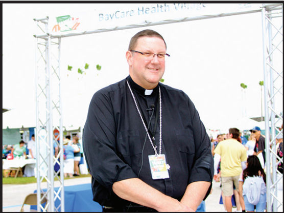
Bishop Gregory Parkes of the Diocese of St. Petersburg organized this free fest in honor of the Diocese’s 50 years of ministry.

A last minute change of venue did not stop 10,000 people from the Tampa Bay area from flooding the Florida State Fairgrounds on October 27. In celebration of 50 years of ministry, the Diocese of St. Petersburg held a free celebratory music and ministry festival.